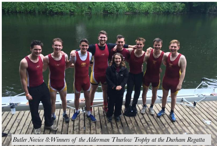
Butler Novice 8: Winners of the Alderman Thurlow Trophy at the Durham Regatta