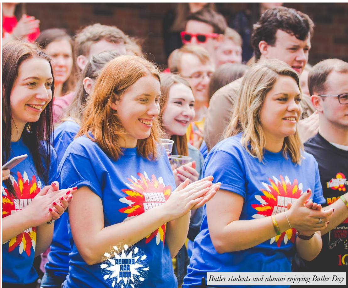
Butler students and alumni enjoying Butler Day