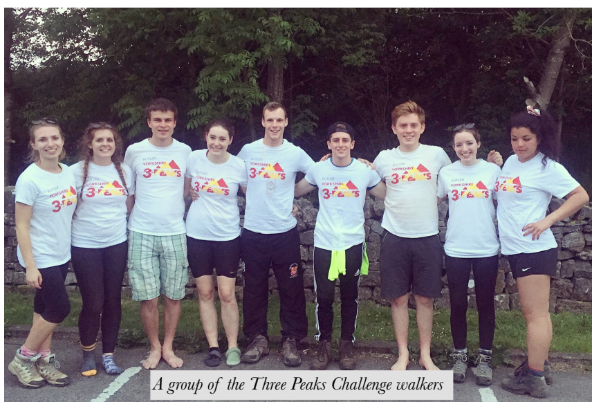
A group of the Three Peaks Challenge walkers

Everyone made it to the top of the first peak in the blazing sun, of what was set to become the hottest day of the year. Unfortunately not everyone was able to conquer all 3 peaks, but that didn't stop us.