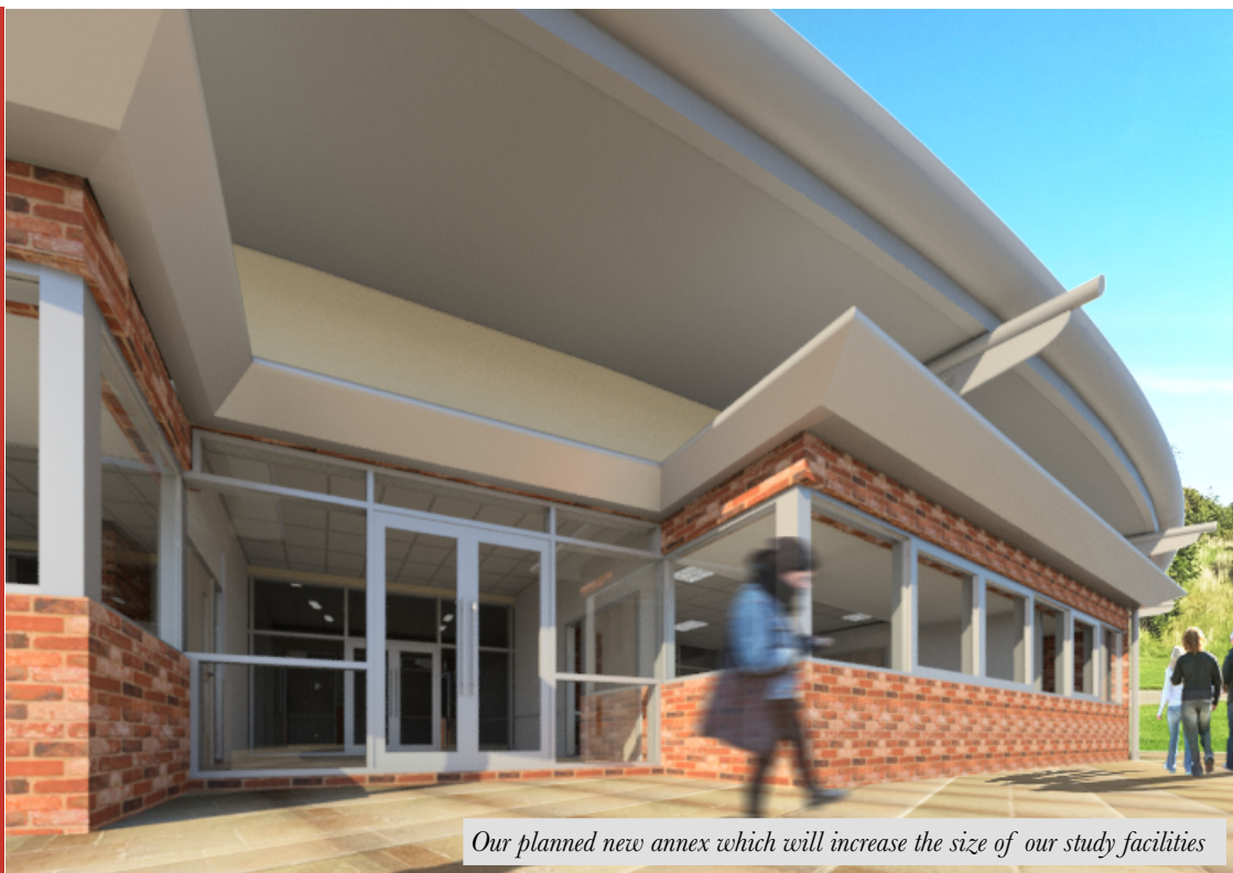
Our planned new annex which will increase the size of our study facilities